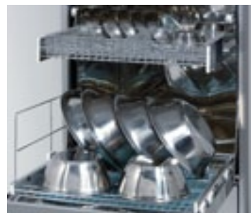
Getinge 46-2 – for wards and outpatient clinics, items on two levels.

Each shelf and spray arm is removable, and the spray-arm fixtures can be used for other accessories, e.g. for cleaning of complicated items such as tubular instruments.