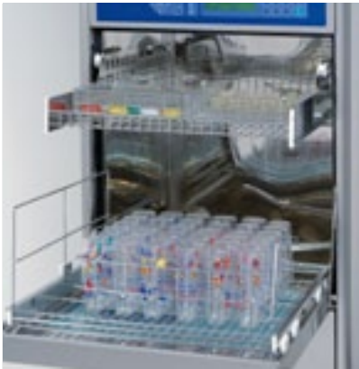
Baby feeding bottles