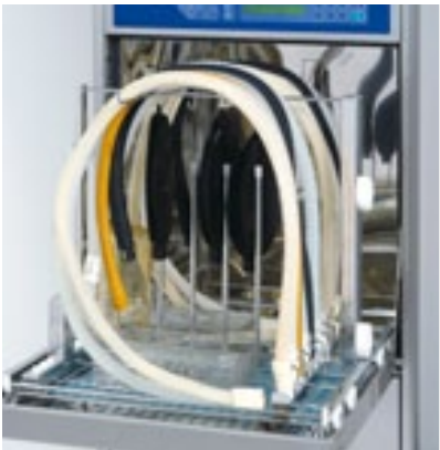
AN wash cart