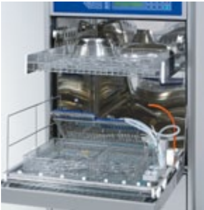
Universal lower wash cart and basic upper wash cart