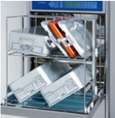
Container wash cart