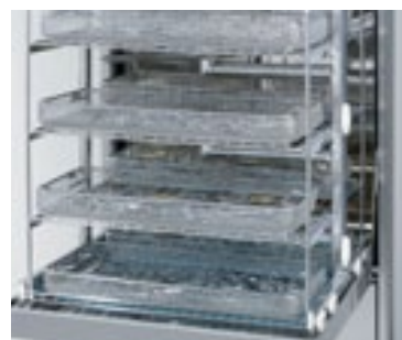
Getinge 46-4 – for surgical departments and smaller central sterile supply departments, items on four levels.