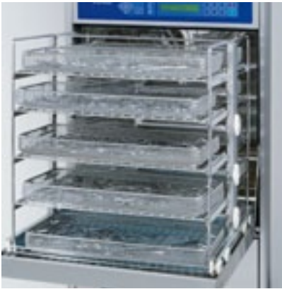
5-level instrument wash cart