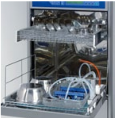
Lower wash cart with L-shaped injector bar