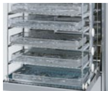
Getinge 46-5 – for larger surgical instrument sets and central sterile supply departments, items on five levels.