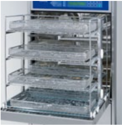
4-level instrument wash cart