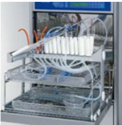
MIS wash cart