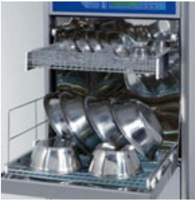
Bowls 2 levels